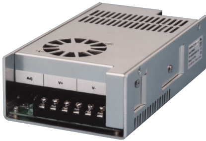
4"W x 7"L x 2"H